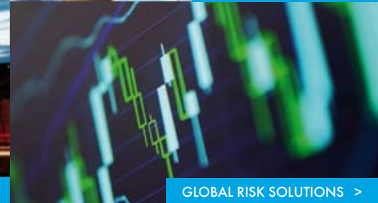
GLOBAL RISK SOLUTIONS >