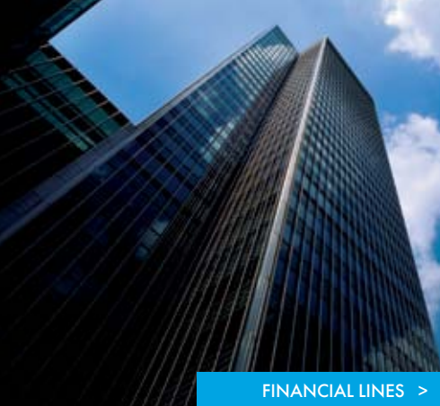
FINANCIAL LINES >