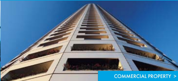
COMMERCIAL PROPERTY >