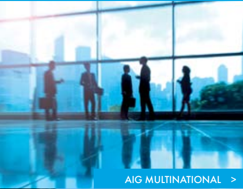
AIG MULTINATIONAL >