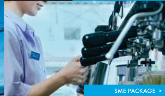
SME PACKAGE >