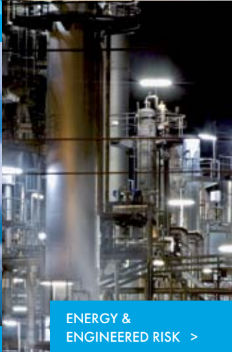
ENERGY & ENGINEERED RISK >