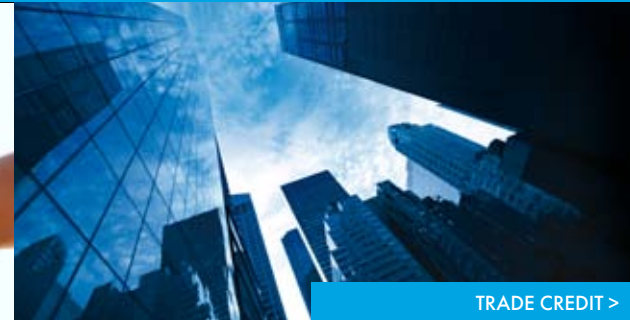
TRADE CREDIT >