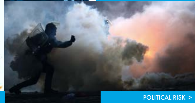
POLITICAL RISK >